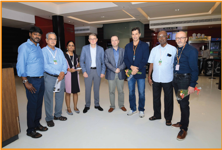
Consul General of Russia in Chennai & Director of Russian Cultural Centre in Chennai at 21st CIFF