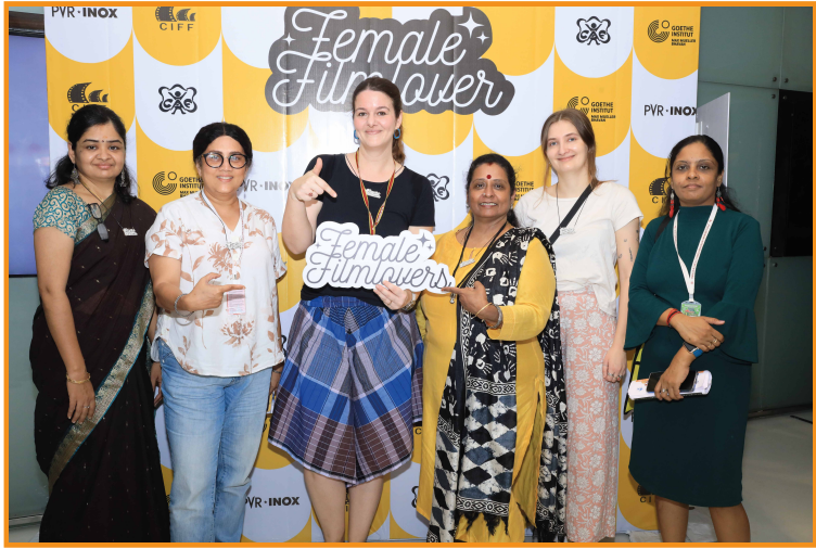
Exclusive Women-only Screening by Gothe-institut, Chennai of the movie AFIRE