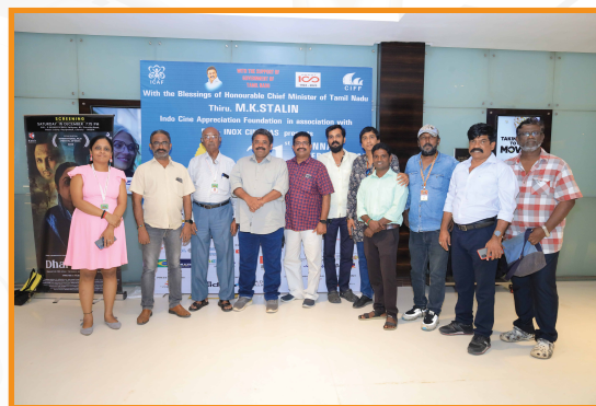
Team Kanne Kalaimane