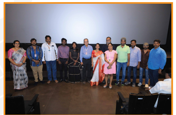
Team KODAI IRUL