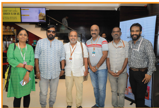
At 21st CIFF